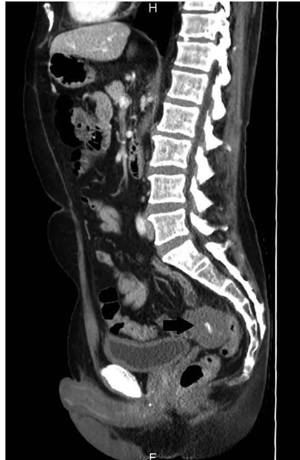
Figure 1. — Computed tomography scan showing a well-described nodular structure of 6 cm with a central dense core of 0.5cm, localized next to the rectosigmoid.

Clinical examination at presentation showed a good general condition. He had no fever and vital signs were