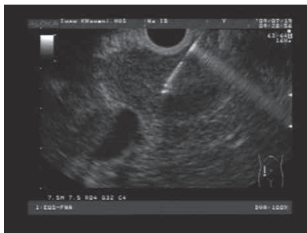
Fig. 2. — EUS shows 3 centimeter tumor with mixed echo in the head of the pancreas. You can see aspiration needle inside the mass (FNA).