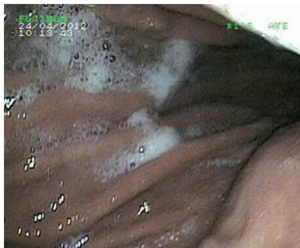
Fig. 2. — Gastroscopy revealed the success of drinking of pineapple juice in the same patient.

Correspondence to : Akif Altınbaş, M.D., Emrah mah Goksel sok 27/8, Incirli, Ankara, Turkey. E-mail : drakifa@yahoo.com