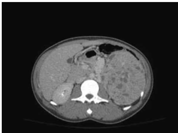
Fig. 1. — Contrast CT of the abdomen showing huge vascular mass arising from the left kidney (arrow).