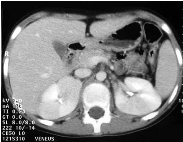
Fig. 1. — CT-scan demonstrating wedge formed lesions in both kidneys.